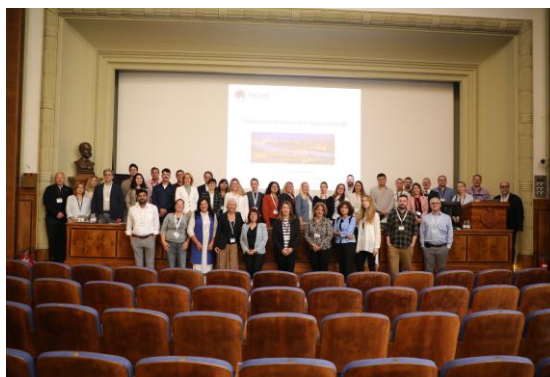
Figure 1. ACA XII conference participants.

The twelfth international conference Advanced ceramics and application , organized by the Serbian Ceramic Society and the Institute of Technical Sciences SASA, with the support of the Ministry of Science, Technological Development and Innovation of the Republic of Serbia and the Serbian Academy of Sciences and Arts, was taking place in the period from September 18 th to 20 th , 2024. The Institute for Materials Testing, the Institute for General and Physical Chemistry, the Institute for Chemical Technology and Metallurgy, and the Institute for the Technology of Nuclear and Other Mineral Resources also took part in the organization of the conference. The companies Analysis, Altium International, MOL Institute and Hotel Palace also supported our scientific meeting. The conference was attended by representatives of the Serbian Academy of Sciences and Arts, representatives of the Ministry of Science, Technological Development and Innovation of the Republic of Serbia, conference participants, guests, colleagues, and friends. This year we had more than 100 participants from Serbia, Romania, Great Britain, Slovakia, Croatia, Germany, USA, Spain, Algeria and Slovenia. 15 plenary lectures, 22 invited lectures, 6 oral and 51 poster presentations were presented.