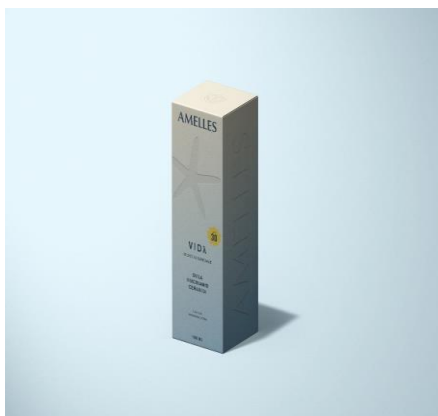
Figure 2. An exhibition of cosmetic products.